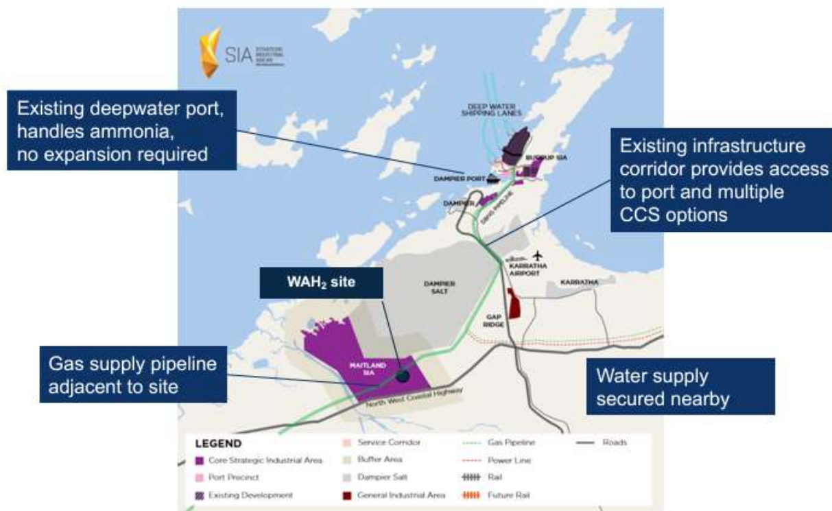
Figure 1: Location of WAH 2 Project