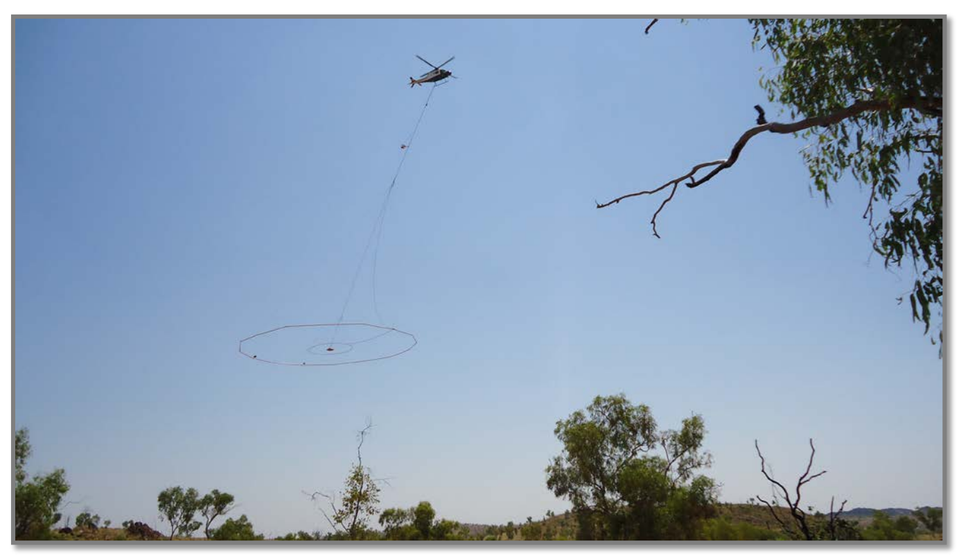
Photo 1: Geotech Airborne Geophysical Surveys flying the VTEM Super Max survey at the McIntosh Flake Graphite Project

The geometry of the system provides a systematic response allowing for intuitive conductor interpretation as well as providing high spatial resolution. The VTEM Super Max provides high near surface resolution combined with depth of penetration.